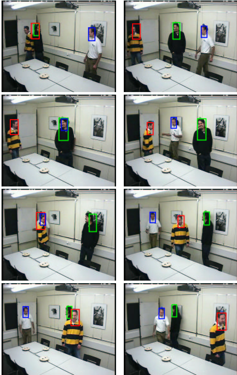
Fig. 4. Snapshots from visual tracking on 200 frames of “seq45-3p-1111”. 200 frames (initial timecode: 00:00:41.17). Tracking results are shown every 25 frames.