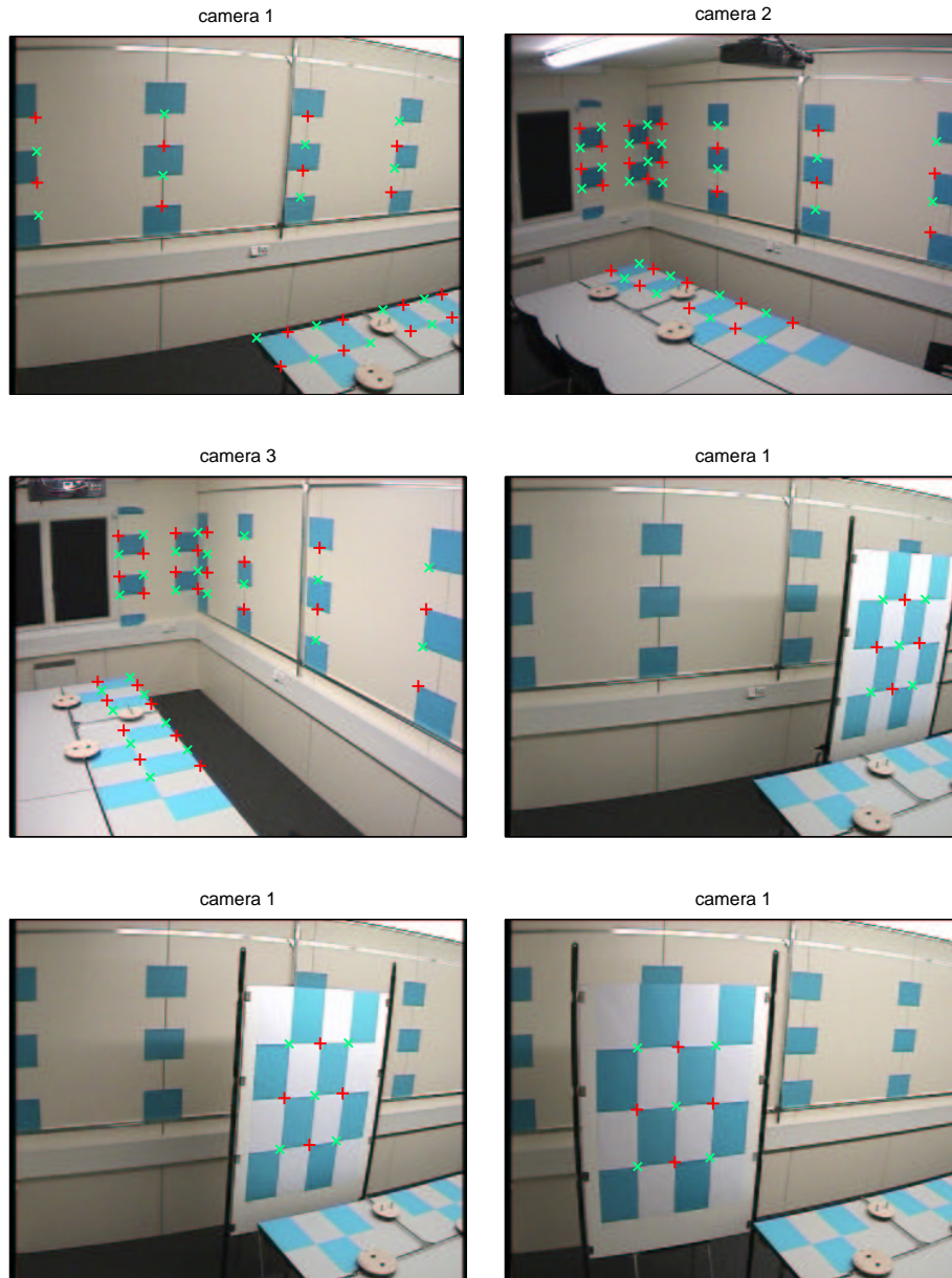
Fig. 2. Snapshots from the cameras at their final positions. Red “+” designate points in the calibration training set \Omega_{\text{train}} , green “x” designate points in the calibration test set \Omega_{\text{test}} .